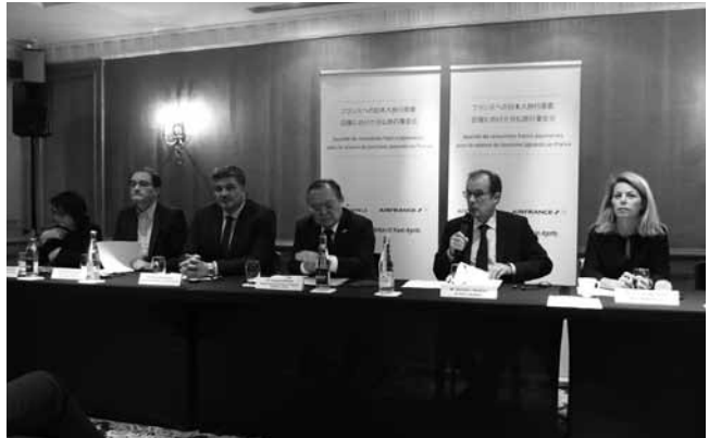
The press conference held in Paris

JATA Sends a Mission to France and Belgium to Reestablish Travel Demand Confirming Safety Measures and Establishing a Cooperation System for Tour Promotion